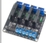
Multi-channel Solid State Relay (SSR) Module (SSR G3MB-202P)